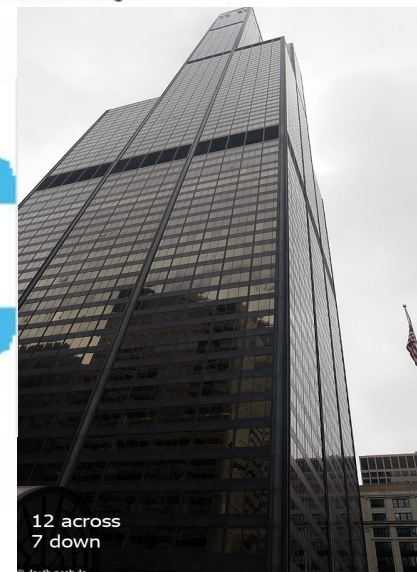
12 across 7 down